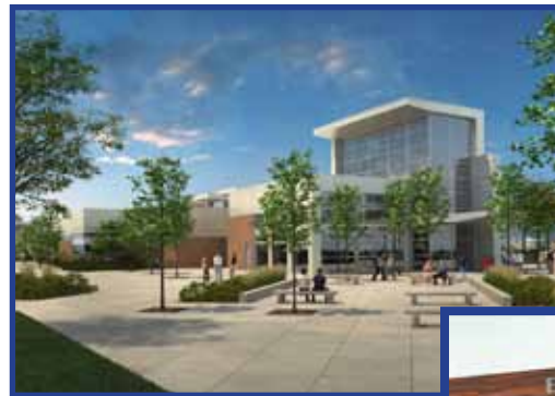
An anchor of the Herriman Town Center, the new library will open in the fall of 2010.

Responsible financing has enabled the library to regularly remodel or replace outdated facilities. In 2009 renewal projects were completed at Riverton, Sandy and Taylorsville Libraries. New building projects in Magna, East Millcreek, Herriman and West Jordan were initiated. This latest building program will add over 95,000 sq. ft. of space to the library system.