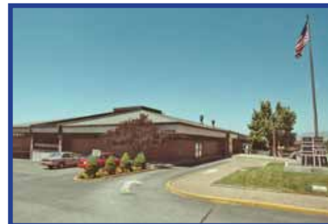
Library Headquarters moved to the Whitmore Library building in 1974

In early 1939, the Salt Lake County Library opened in two rooms of the old Midvale School. Its popularity was tremendous and within four months the library had issued a library card to more than 1,700 patrons. Today over 70% of area residents hold a library card with an average of 175 new cards issued every day.