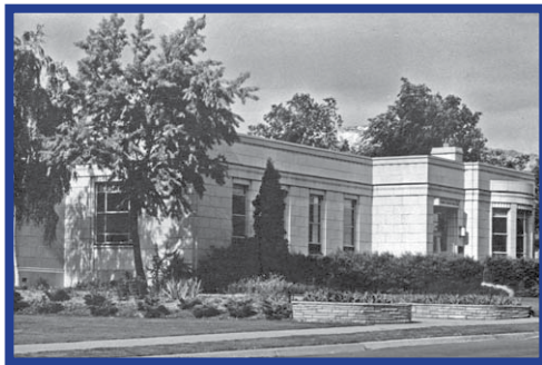
First Headquarters building in Midvale

T he mission of Salt Lake County Library Services is to make a positive difference in the lives of our customers by responsively providing materials, information and services at community libraries located throughout the Salt Lake Valley and/or via the Library’s website.