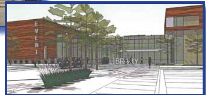
Library administration will be housed in the new West Jordan Library complex along with a large community meeting space.